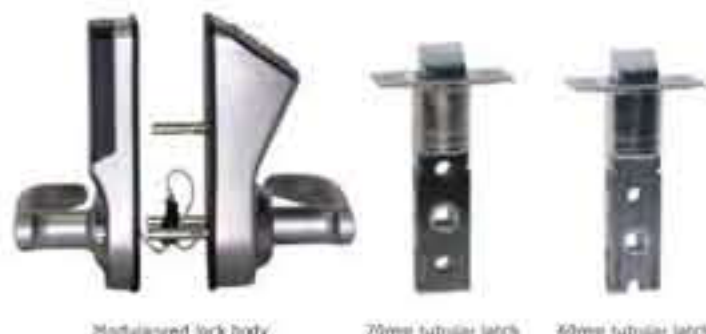
Modularized lock body